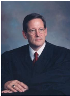
The Honorable Donald W. Lemons, Chief Justice Term expires: March 16, 2024