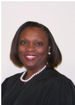
The Honorable Cleo E. Powell, Justice Term expires: July 31, 2023